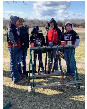
Girls and Boys can participate in many Spring activities including HMS Track and Trap Club.